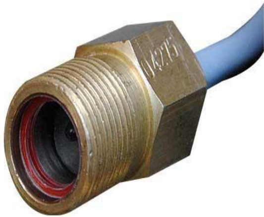
IR SENSOR FOR DONNELLY CHUTE